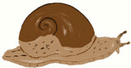
樹棲蝸牛 • Arboreal Snail