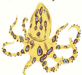
藍紋章魚 • Blue-lined Octopus