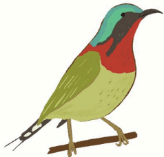
叉尾太陽鳥 • Fork-tailed Sunbird