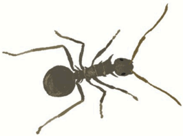
多刺蟻 • Spiny Ant