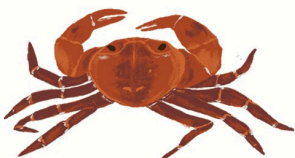
香港南海溪蟹 • Nanhaiipotamon hongkongense