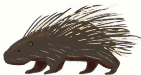
東亞豪豬 • East Asian Porcupine